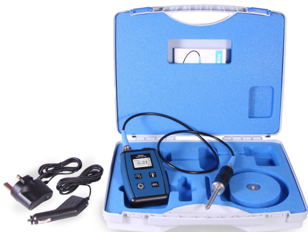
HS-630 in case