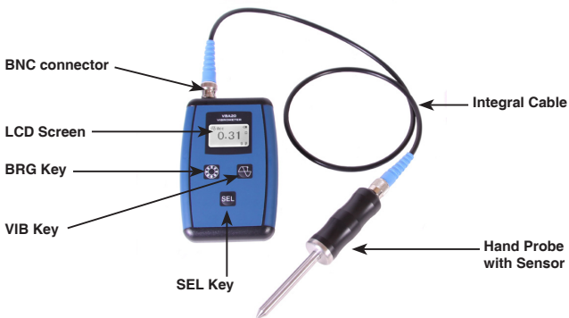
Figure 1. The VBA20