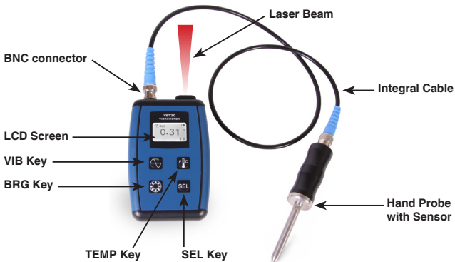
Figure 4. HS-630

The HS-630 uses a thermopile infra-red sensor to indicate temperature in Deg. C or Deg. F on the display. An alignment laser beam is provided to indicate the area where the temperature is being measured. Ambient temperature is also indicated in the bottom left of the display.